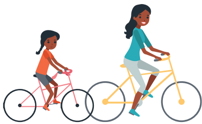
Rode your bike