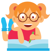
Read a book